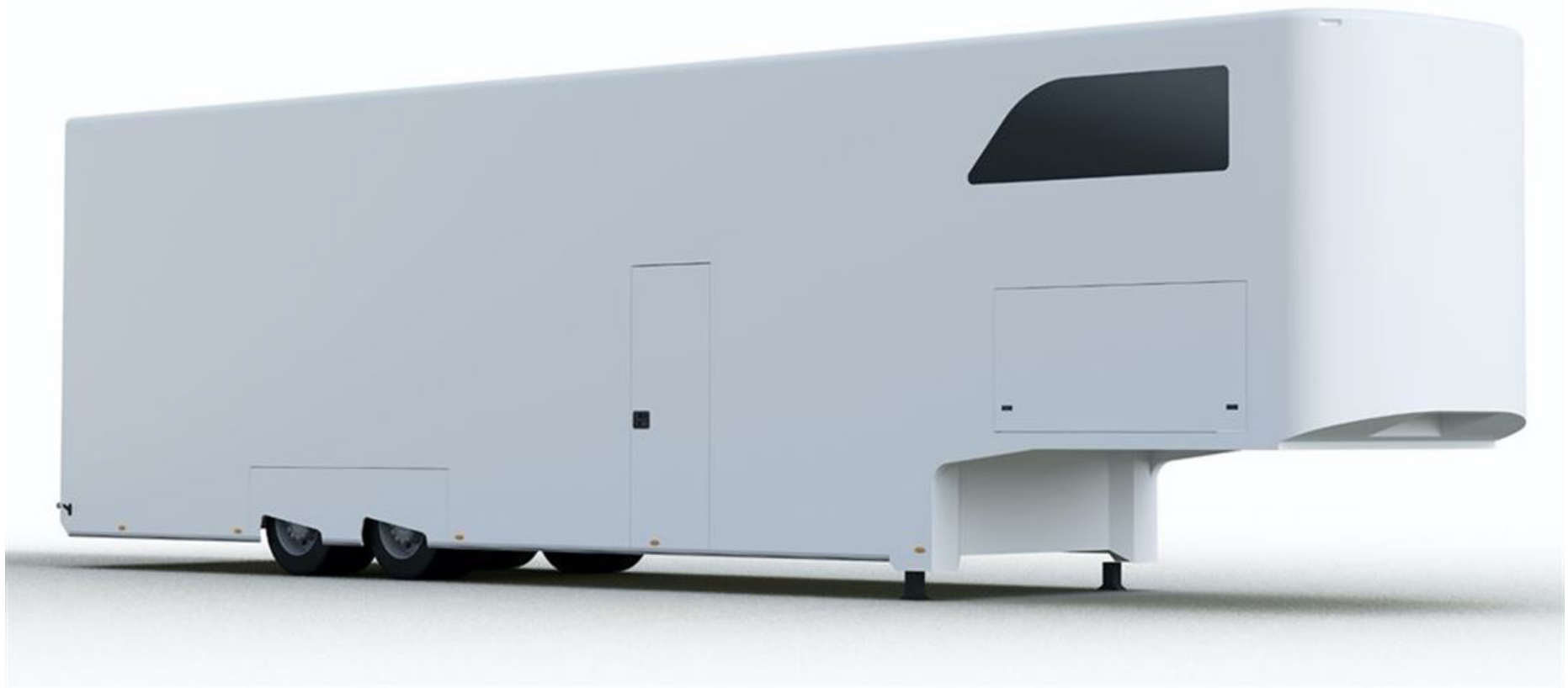
ASTA CAR Z3 EVO