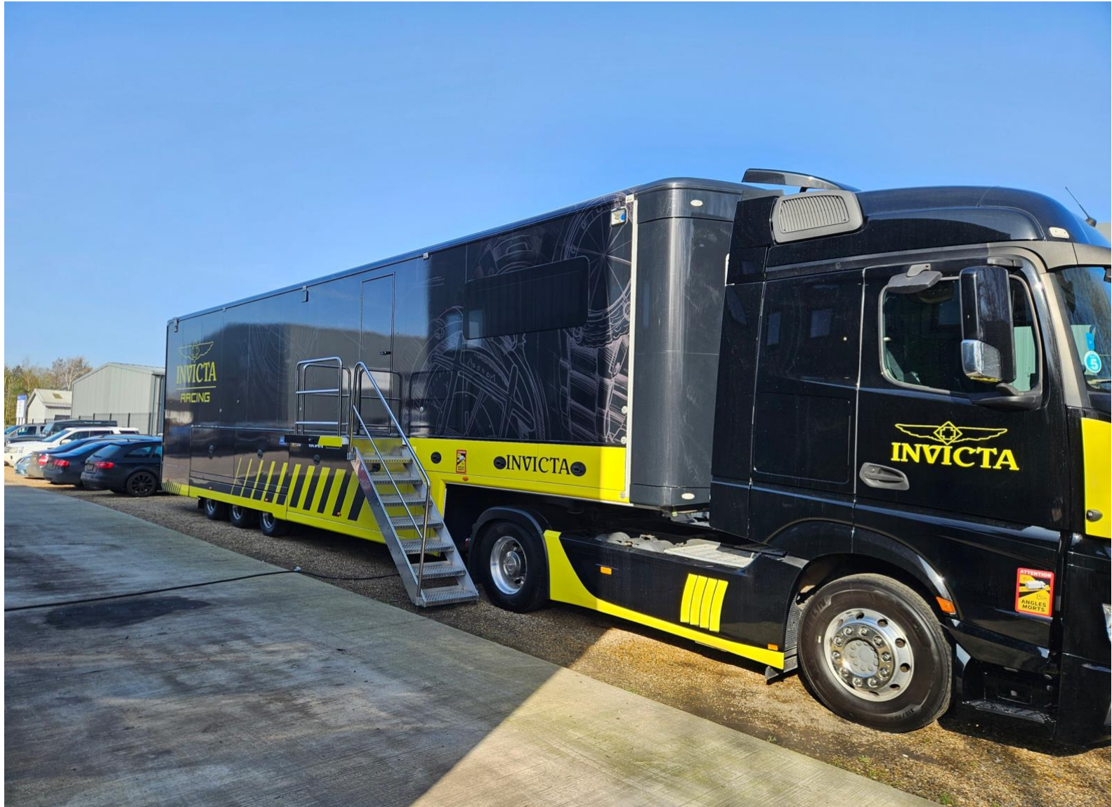
WMT RACING TRAILER