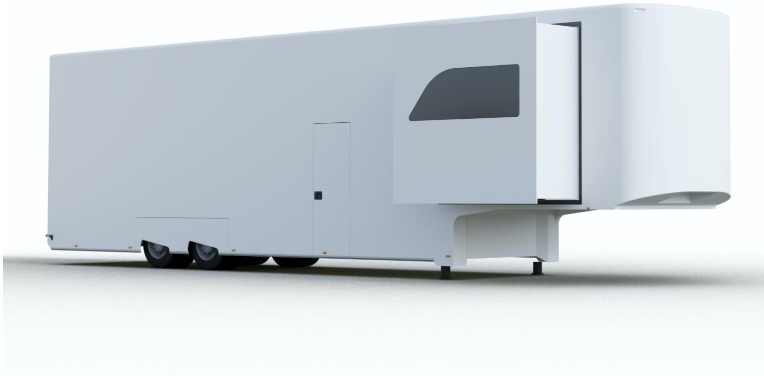
STOCK 4698 ASTA CAR Z3 SLIDE